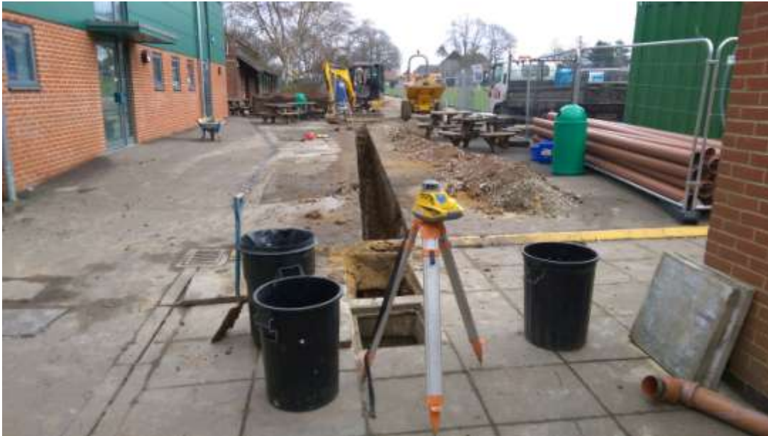
Plate 5. Service trenching to Performing Arts Building (looking east)