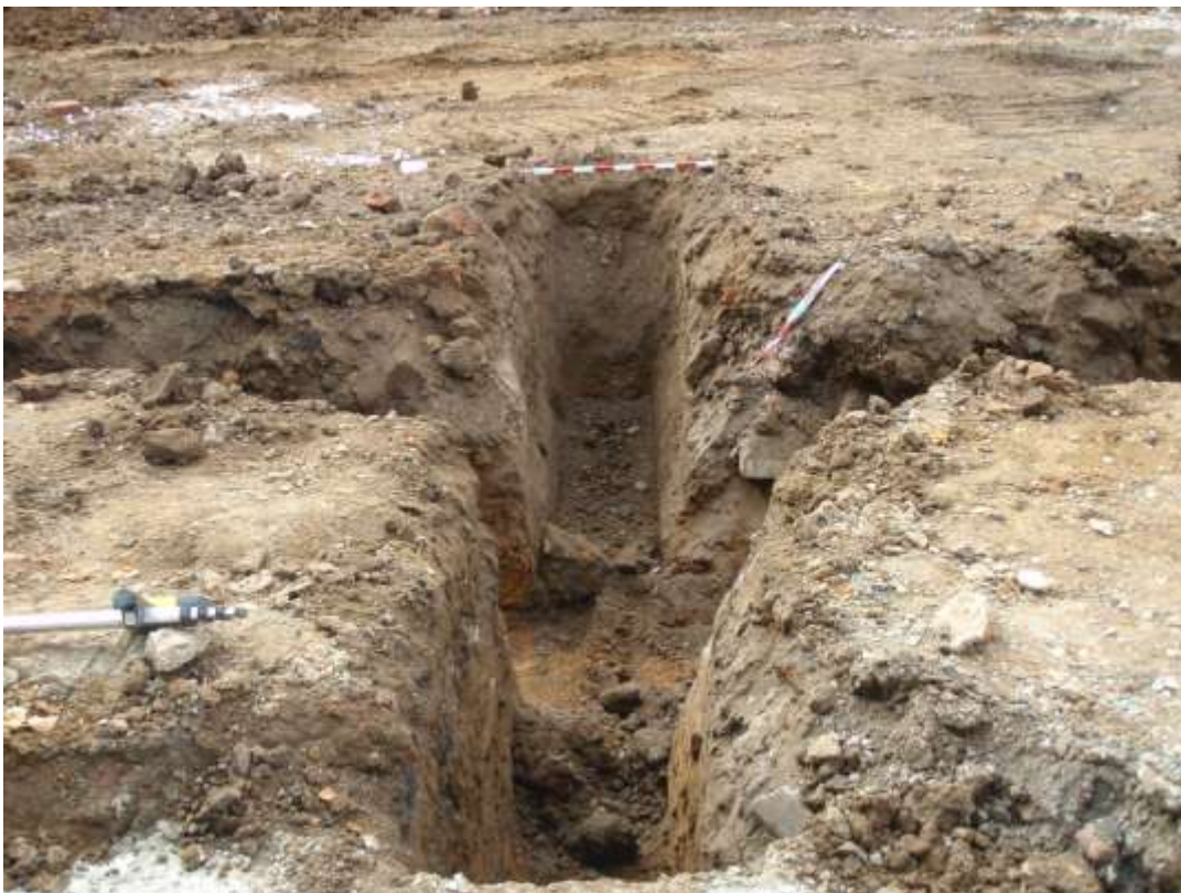
Plate 8. Trenching (looking south)