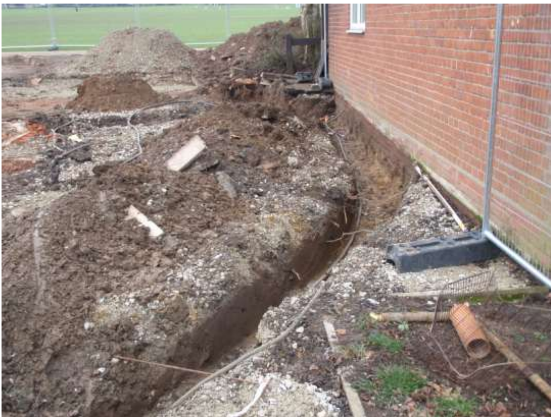
Plate 6. Service trenching to Performing Arts Building (looking south)