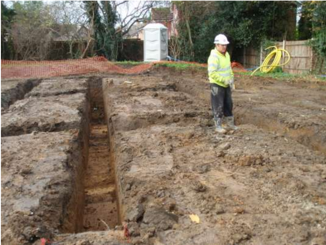
Plate 14. Foundation trenching (looking south)