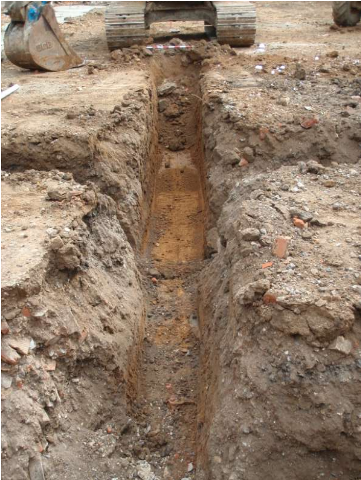
Plate 11, Foundation trenches (looking west)