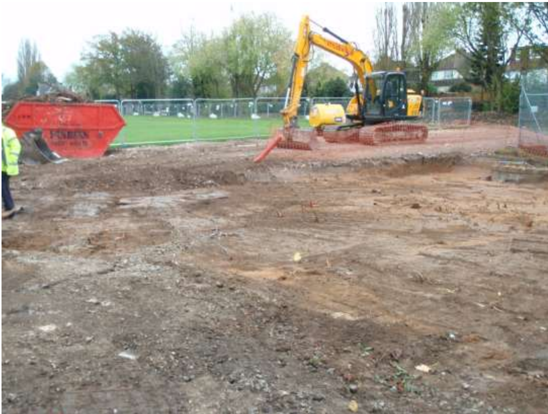
Plate 12. Topsoil strip (looking east)