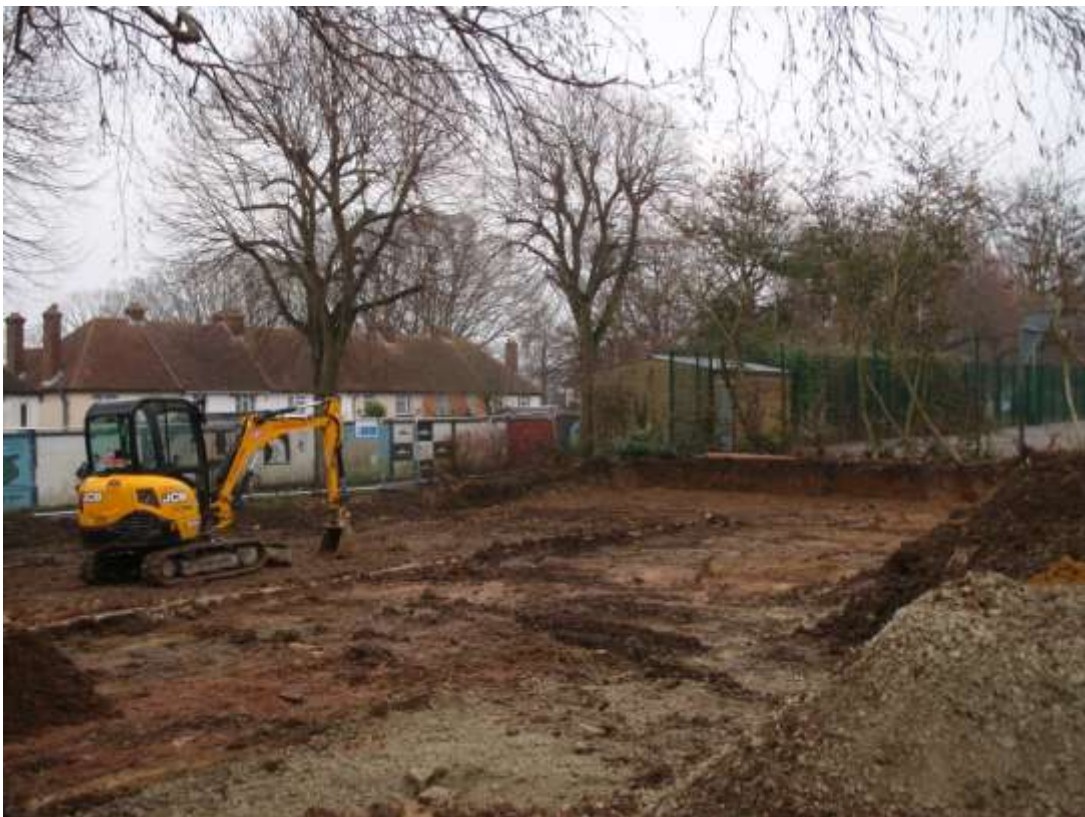
Plate 4. Subsoil strip (looking NE)