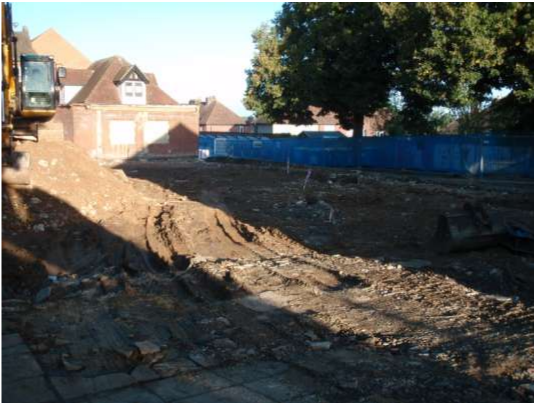
Plate 7. Demolition strip (looking SE)