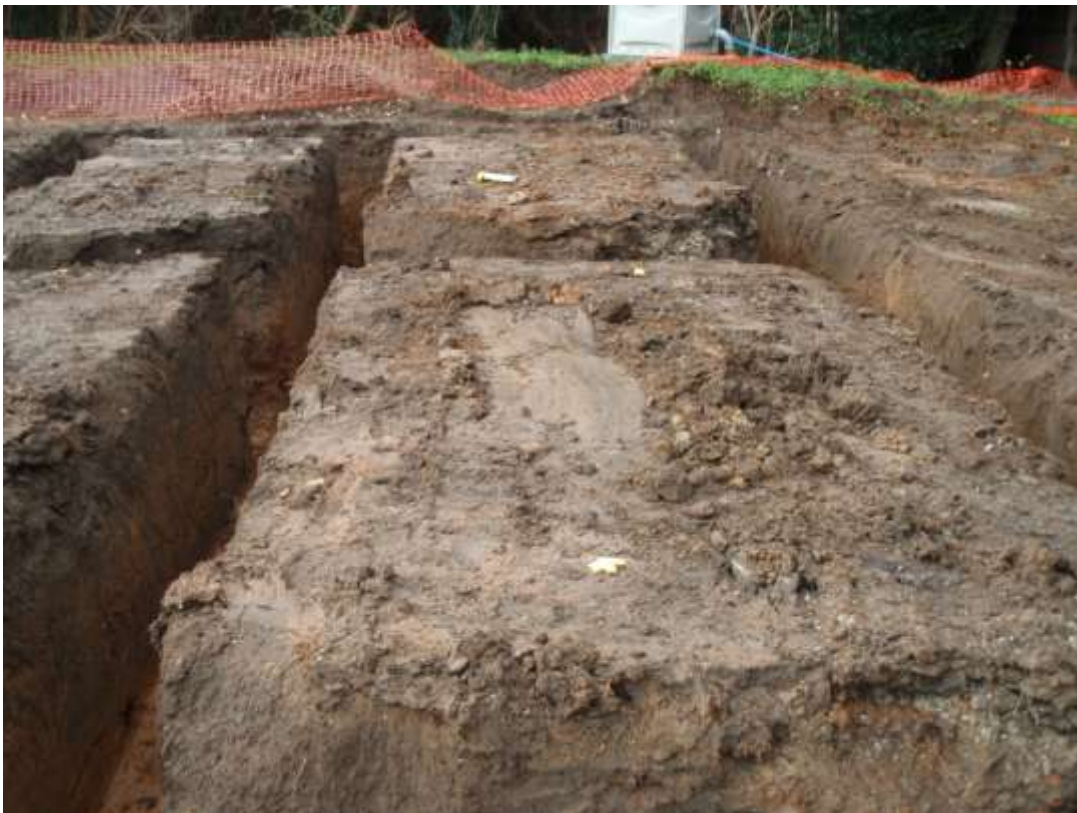
Plate 15. Foundation trenching (looking west)