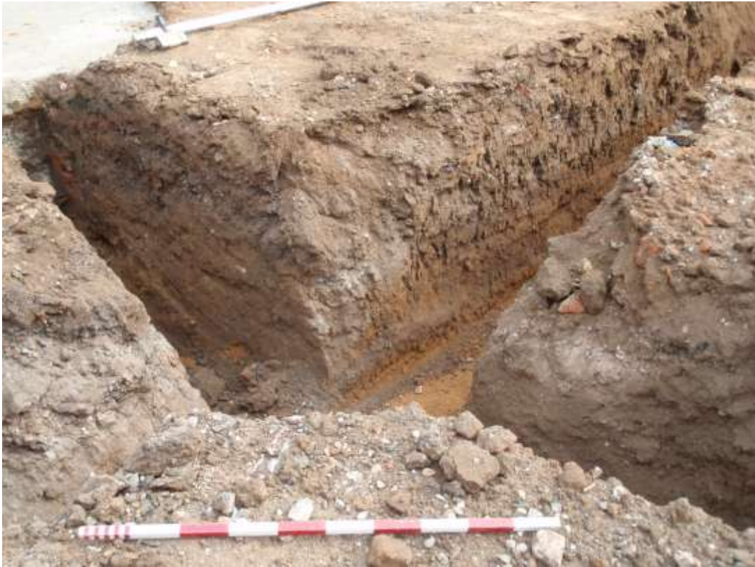
Plate 9. Foundation trenches (looking west)