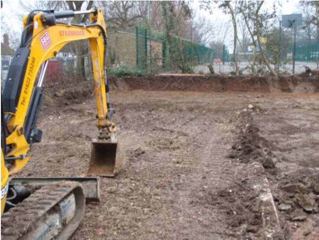
Plate 3. Subsoil strip (looking east)