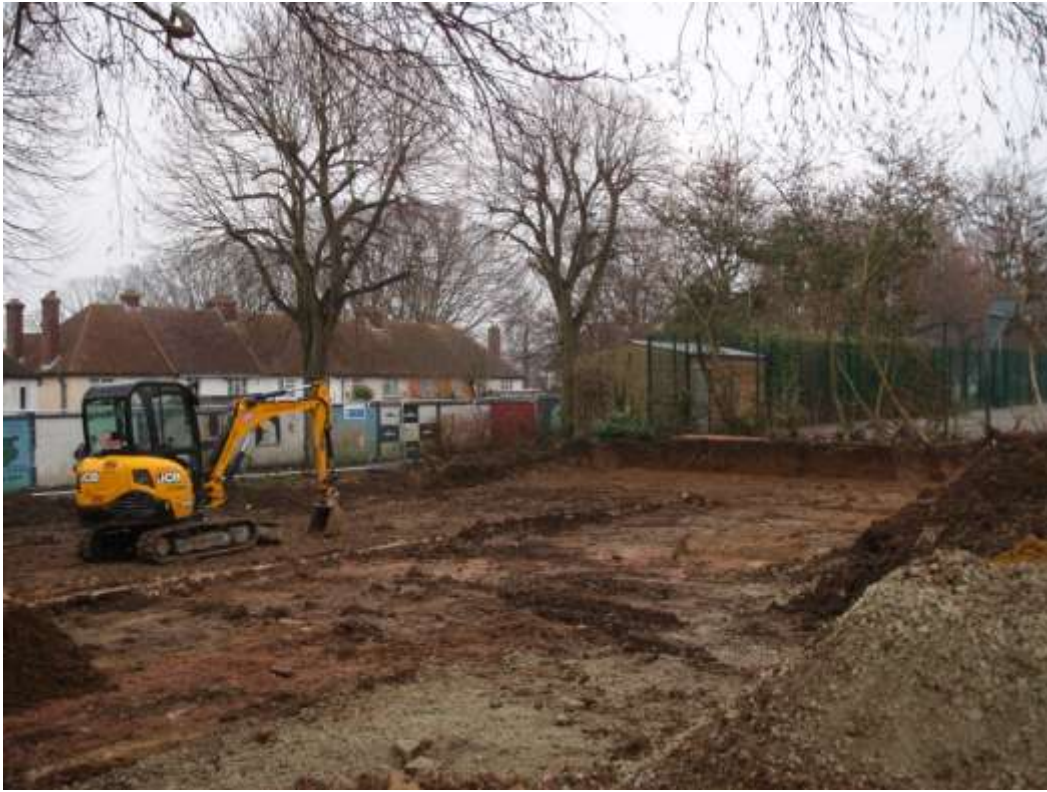
Plate 1. Topsoil strip (looking NE)