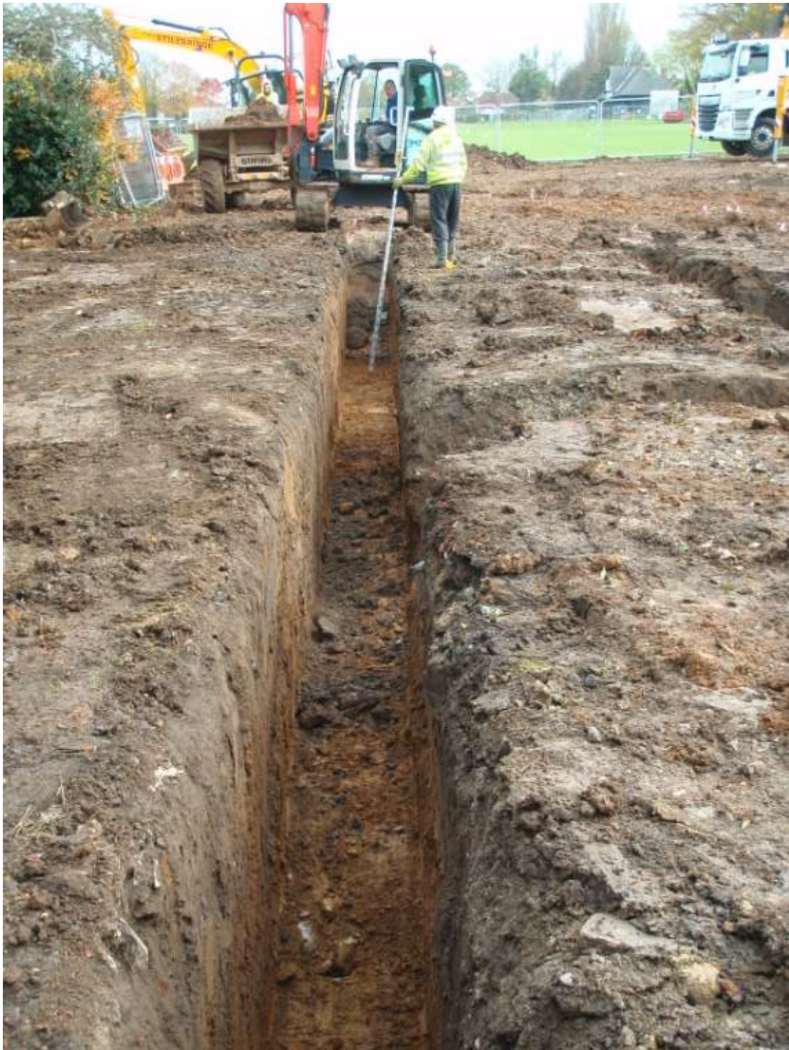
Plate 16. Foundation trenching (looking east)