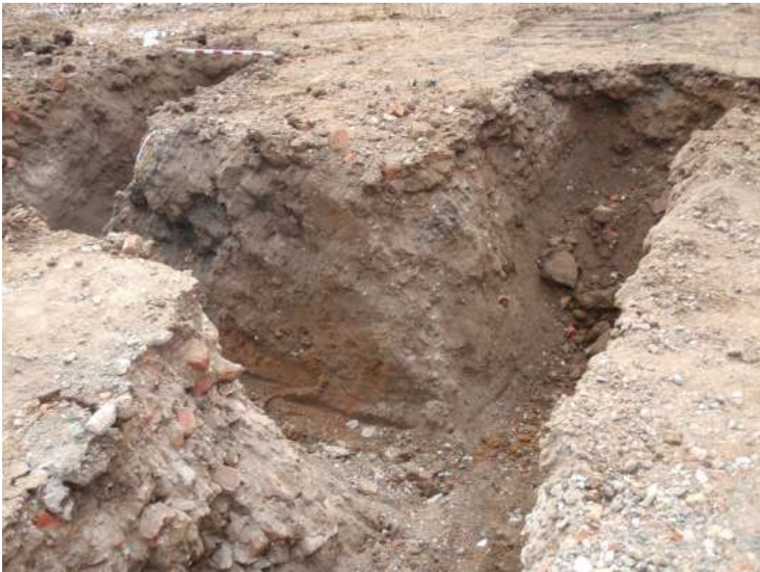
Plate 10. Foundation trenches (looking east)