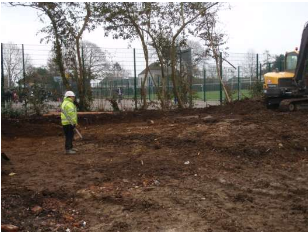
Plate 2. Topsoil strip (looking SE)