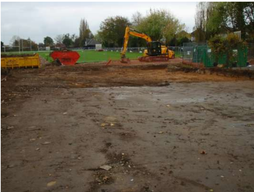
Plate 13. Topsoil strip (looking east)